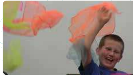
Arts Festival: 5/25/16