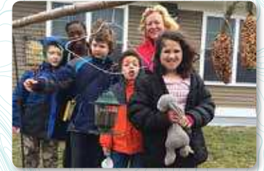
Science Fair: 4/15/16