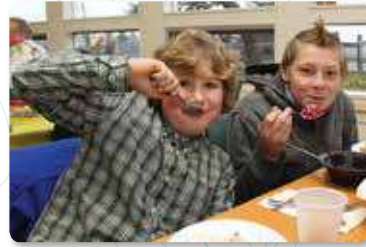
Thanksgiving Luncheon: 11/19/15