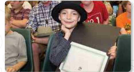
Awards Ceremony: 6/24/16

To read more about these annual events, please visit our new website at SpauldingYouthCenter.org/news-events/happenings/