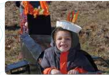
Winter Carnival: 2/26/16