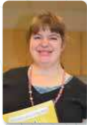
Author's Tea: 10/23/15

Spaulding Youth Center hosts countless holiday celebrations, special events, spirit day festivities and success ceremonies throughout the year. These events have become a staple in campus life as both students and staff look forward to the planning and celebration each year. Here are a few of our favorite snapshots from 2015-2016.