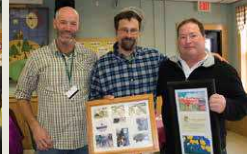
11th Annual You've Got a Friend Award 2015