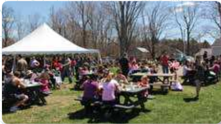
Foster Care Day: 5/7/16