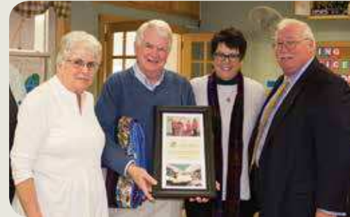
9th Annual Arthur H. Nighswander Community Partner Award 2015