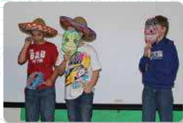
Multicultural Celebration: 12/18/15