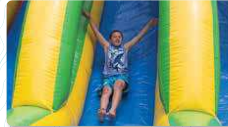
Field Day: 6/23/16